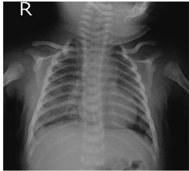
Figure 1. Chest x-ray of the patient with COVID-19; pulmonary opacity can be seen in right middle lobe, with predominantly peripheral distribution, and haziness in the left upper lobe

These findings were confirmed by CT-scan showing a consolidation in left upper lobe, peripheral patchy ground-glass opacification, and reticulation in right upper, left upper, right middle, and lingual lobes. The mentioned signs were highly suggestive of COVID-19 (Figure 2).